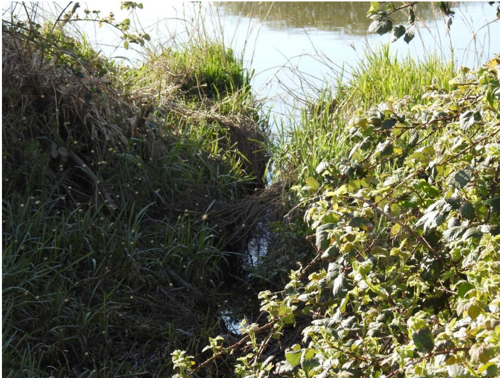
Figure 1 : Beaver channel to River Stour taken 29 March 2026

The following three images were taken at the location shown on first page taken 29 March 2026, by George Cooper in response to the request from Dr Richard Hunt from the Examining Authority during ISH3.