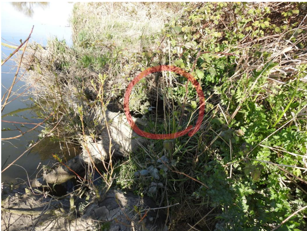
Figure 2 : Beaver trail going under a large patch of brambles taken 29 March 2026