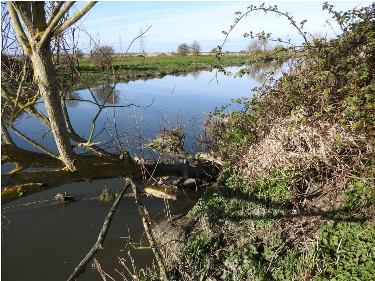
Figure 3 : Beaver activity evidence the other side of the bramble patch taken 29 March 2026

This is the likely location of the beaver lodge.